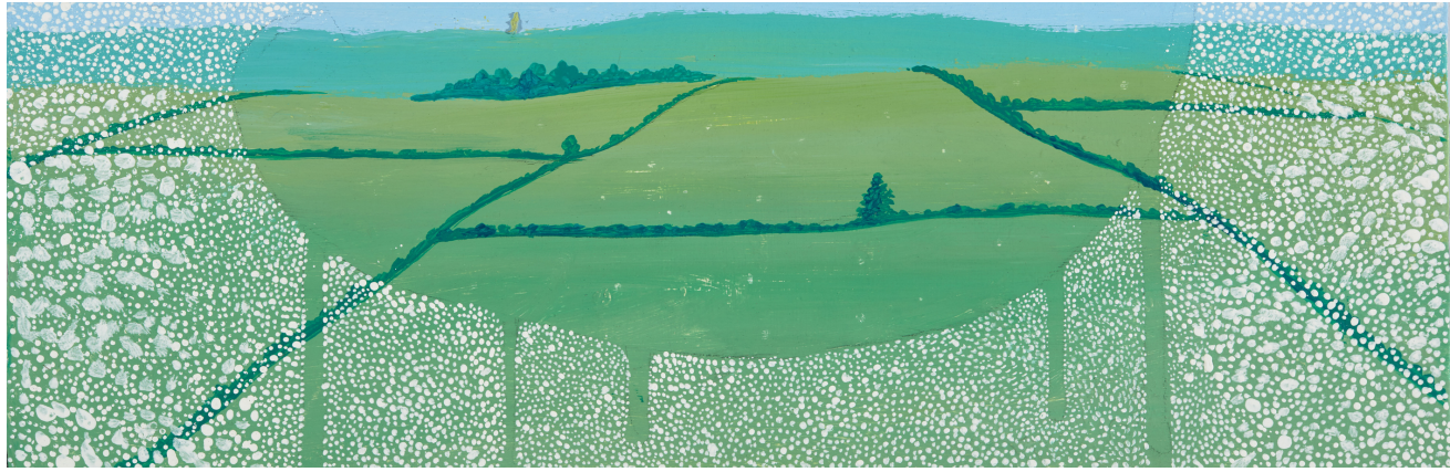
Window, Kemple View (secure hospital), Image courtesy of Koestler Arts

You can read the panel's full response to the strategy <u>here</u>.